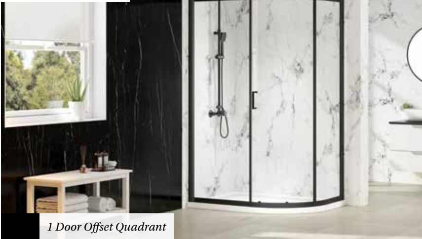
1 Door Offset Quadrant