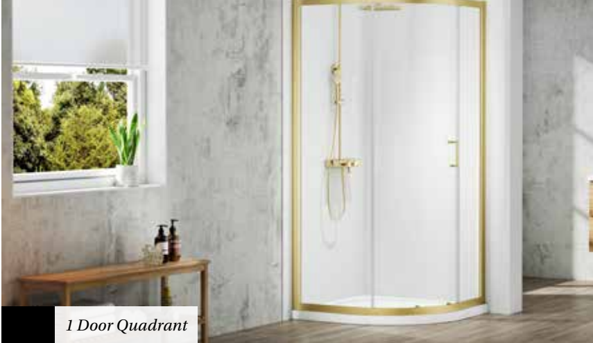
1 Door Quadrant