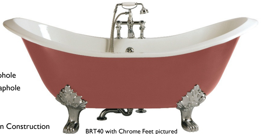
BRT40 with Chrome Feet pictured