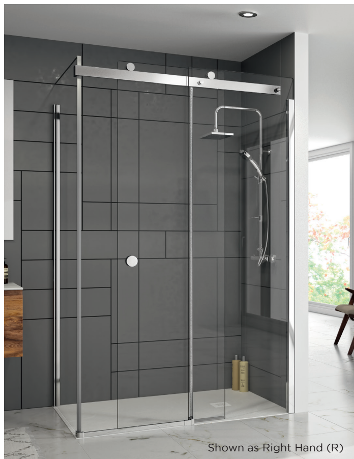
Shown as Right Hand (R)